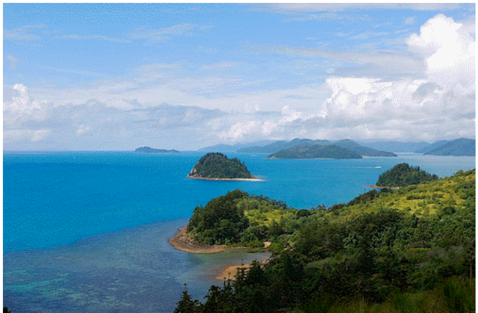
right: looking south from South Molle Is.