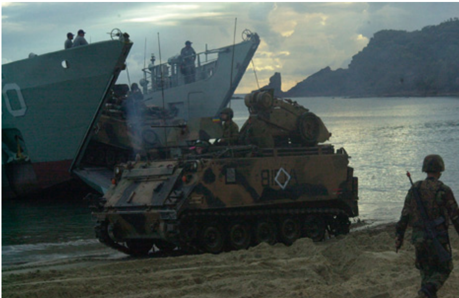
Australian APCs on the beach.

More information on Notices to Mariners is available at: http://www.msq.qld.gov.au/Home/Notices_to_mariners/