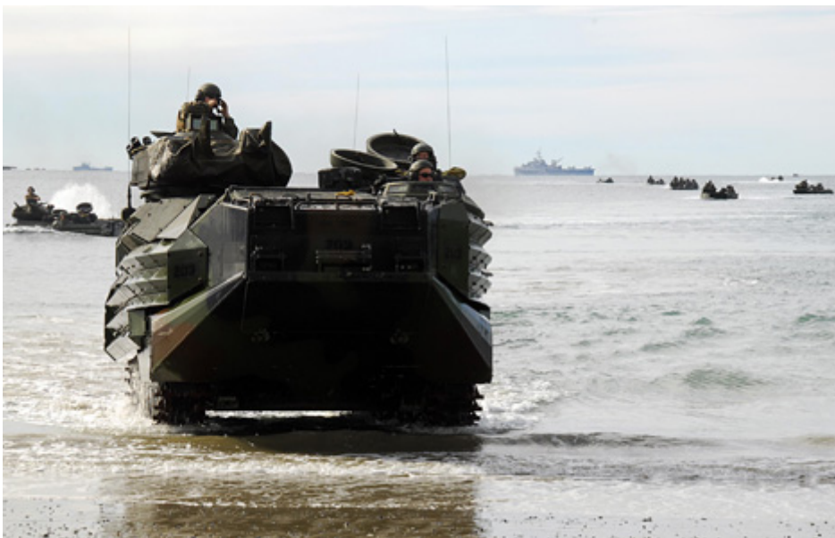
US Marine (31st MEU) AAV lands at Freshwater Bay

After Hours - Range Control Duty Officer: 0408 023 376