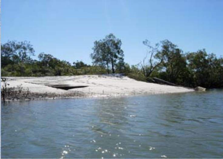
log dump, Urang Creek