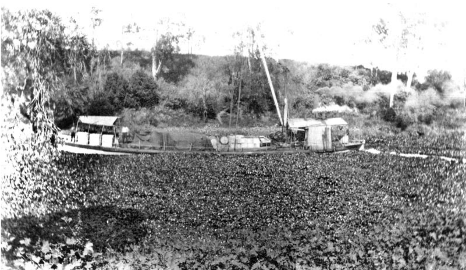
Essex pushing through Hyacinth water weed infestation, Bremer River