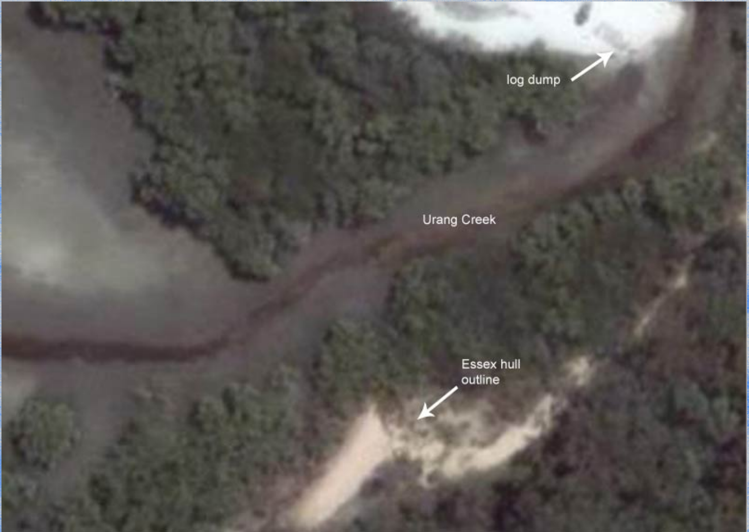
satellite view, Urang Creek, Fraser Island