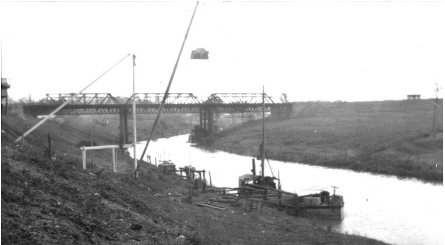
Essex unloading cargo, Bremer River

Visiting hours are best at high tide. The wreck is on the southern bank, eighty metres downstream of the log dump on the opposite bank, and can be pinpointed by the yellow sand surround.