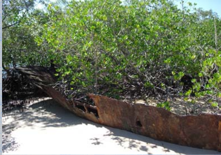
mangroves growing through the hull