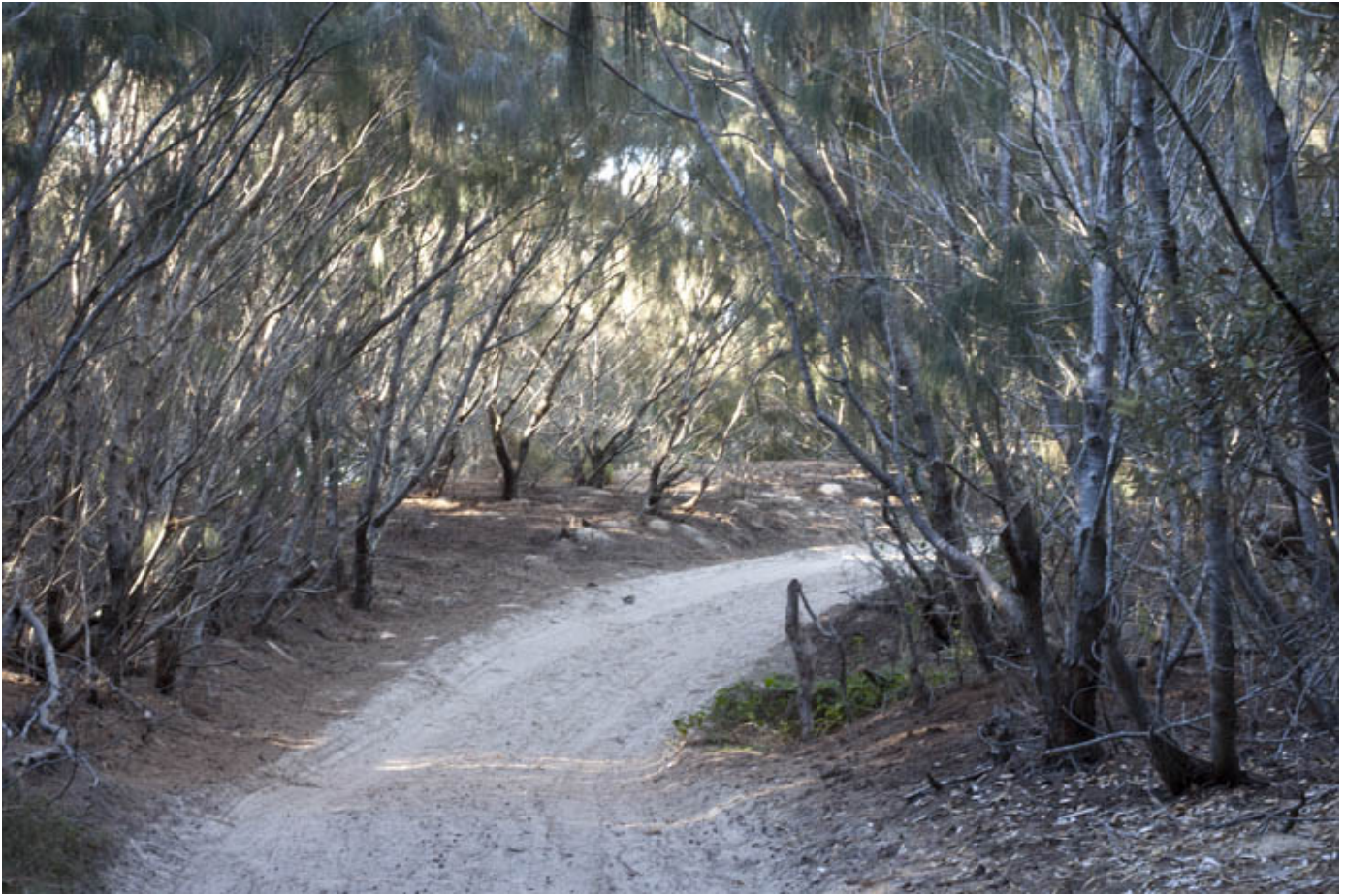
Above: the track from North Curragee to the ocean beach