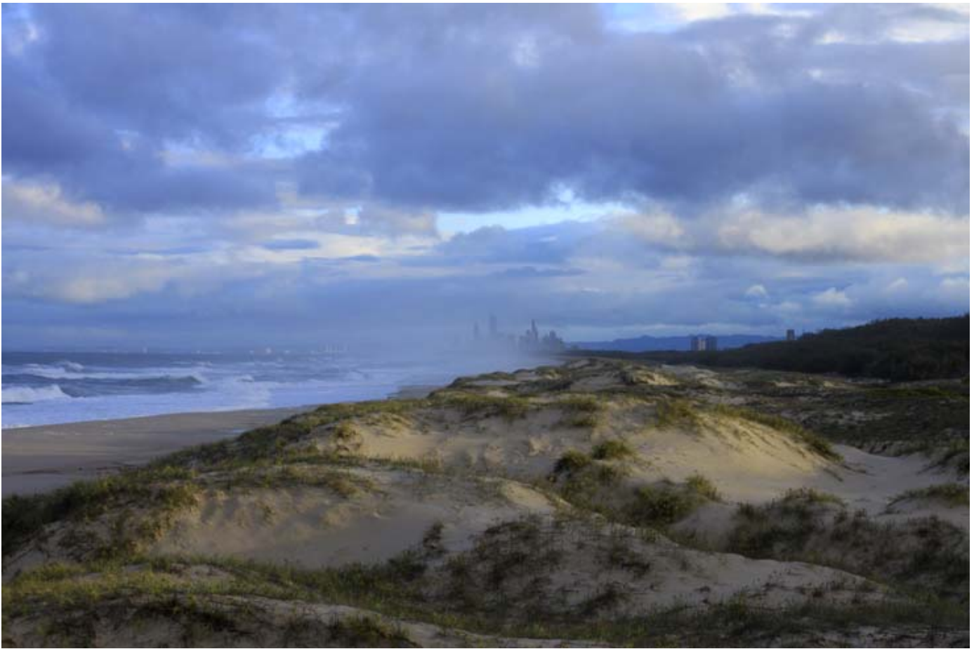
Surfers Paradise hi-rise 12 km south

The cover photograph of this magazine is Surfers Paradise hi-rise towers, seen from the ocean beach at North Currigee. .