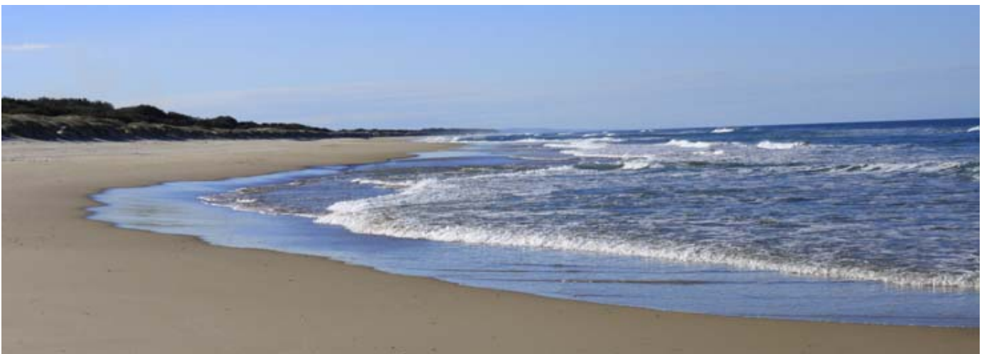
the beach north from North Currigee