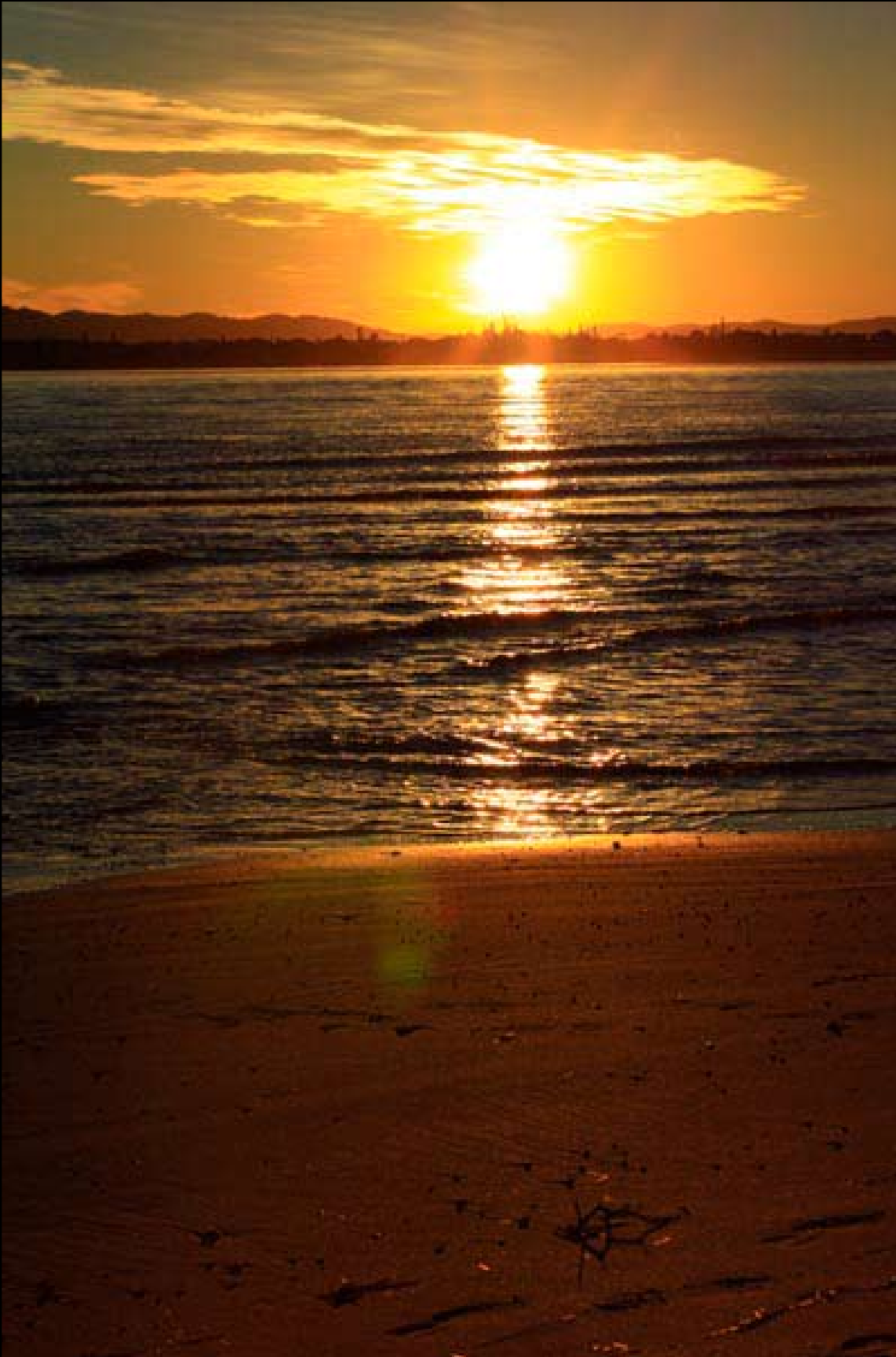
South Stradbroke Island